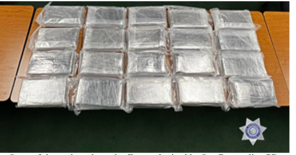
Some of the packaged powder Fentanyl seized by San Bernardino PD.

The street value of the confiscated illicit substance, a synthetic opioid which over the last three years has become increasingly popular among a segment of society and overdoses of which, according to those crusading against