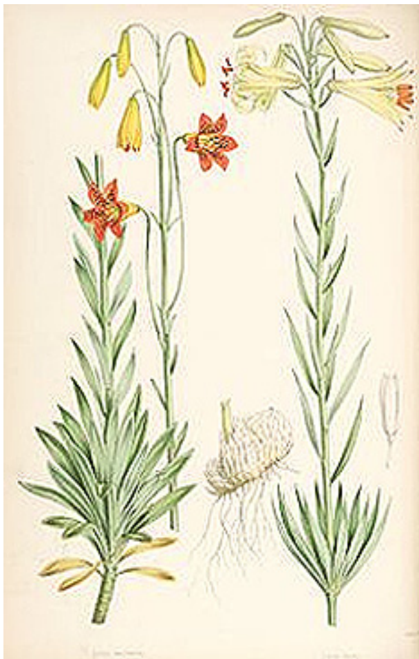
Henry John Elwes' 1880 monograph of the genus Lilium ; illustrated by W.H. Fitch and published by Taylor and Francis, London

scaly, elongated bulb up to 4.33 inches long. The leaves are generally linear in shape, up to 11.5 inches long, and usually arranged in whorls around the branched stem, and drooping at the tips. The inflorescence is a raceme bearing up to 31