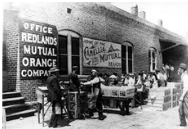
Redlands Mutual Orange Company in 1907